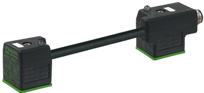
Valve plug 2 Valve plug 1 Male M12